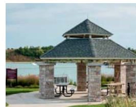
Pavilion D: North Lake Pavilion