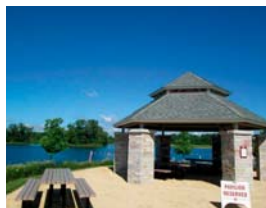
Pavilion B: Island Pavilion