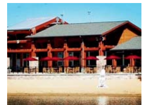
Lakehouse Patio: Available after Labor Day