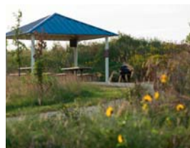
Pavilion C: Volleyball Court Pavilion