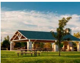
Pavilion A: Picnic Grove